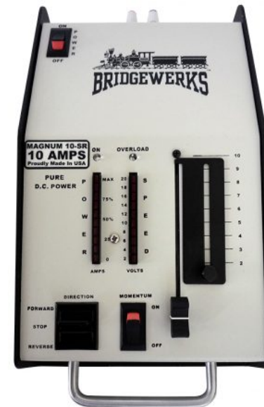
5-SR - $333 10-SR - $384 15-SR - $420