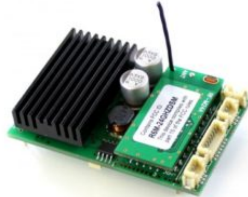
Receiver w/Sound $141