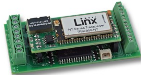
Throttle and Transducer 6 amp $219 10 amp $249