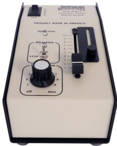
Mini-Mag 3S - $209