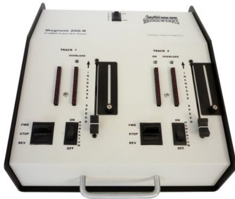
Magnum 200-R - $640