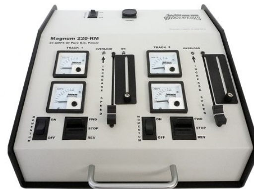
Magnum 220-RS - $720