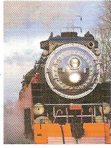
Garden Railroad Design Old Trains Wanted

Any Member who has a business related to our hobby is welcome to submit an entry for inclusion in PGRS Trackin' each month.