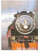
Garden Railroad Design Old Trains Wanted