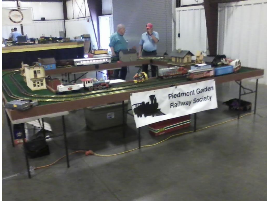
PGRS is 'in the house'. Autumn Rails display.