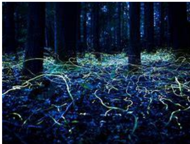
Blue Ghost Fireflies

I live in Fletcher NC, just south of Asheville and right up the street from my house is a micro-brewery called Blue Ghost Brewing Co. Their name references the unique type of firefly found only in the moist hollows of this part of the country. [ Very interesting if you like bugs, so you may want to Google; "Blue Ghost Fireflies" to learn more about them.]