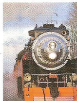
Garden Railroad Design Old Trains Wanted

Any Member who has a business related to our hobby is welcome to submit an entry for inclusion in PGRS Trackin' each month.