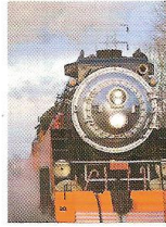
Garden Railroad Design Old Trains Wanted

The Right Track Toy Train Museum A non-profit museum to benefit Pancreatic Cancer research 2414 Memorial Hwy (Rte 64/74) Lake Lure, NC 28746 Find us on Facebook!