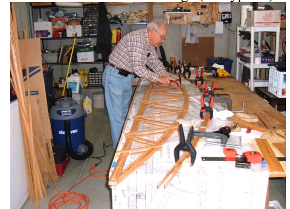
Construction of an arch bridge (of Cypress):

Many of our members do not have a railroad, but join and belong in order to get ideas and practical information on planning and building a railroad.