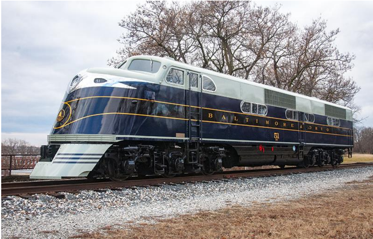
Baltimore & Ohio 51 has restored by the B&O Railroad Museum.