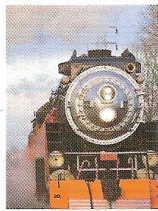
Garden Railroad Design Old Trains Wanted