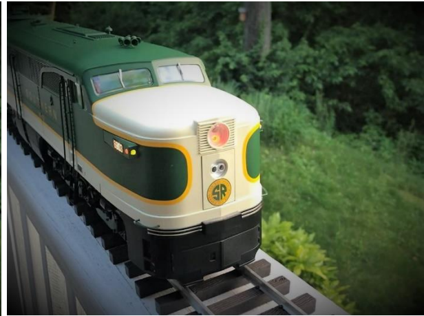
Head lights off and Red Light on