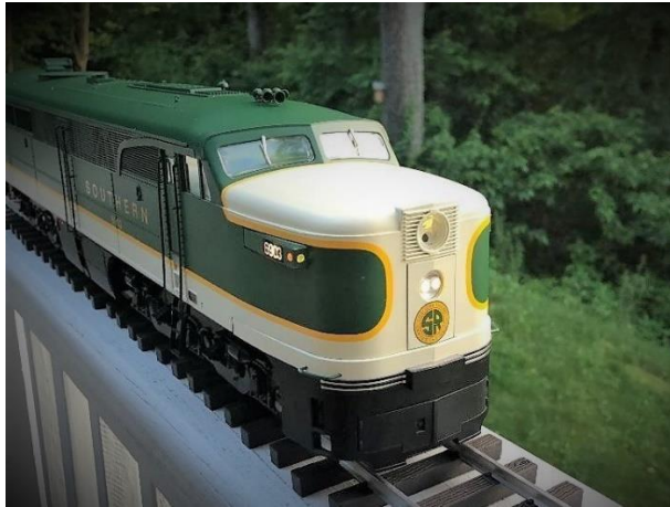
The new head lights and Mars light