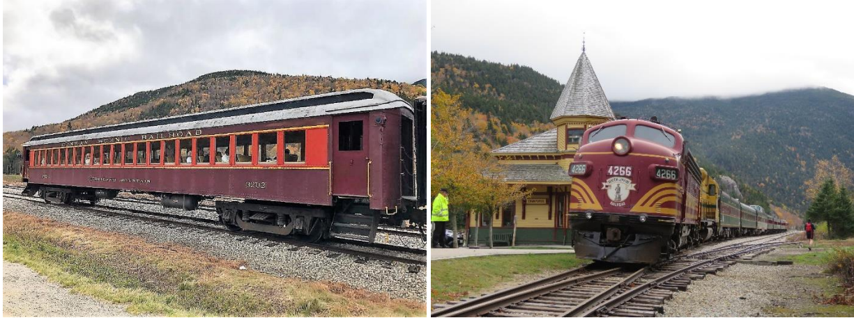
Conway Scenic Railroad in New Hampshire