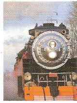
Garden Railroad Design Old Trains Wanted